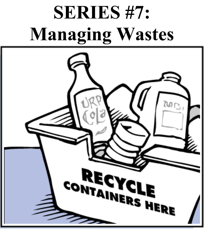
Hands In for Healthy Streams is a cooperative effort between the City of Buford and the local business community.